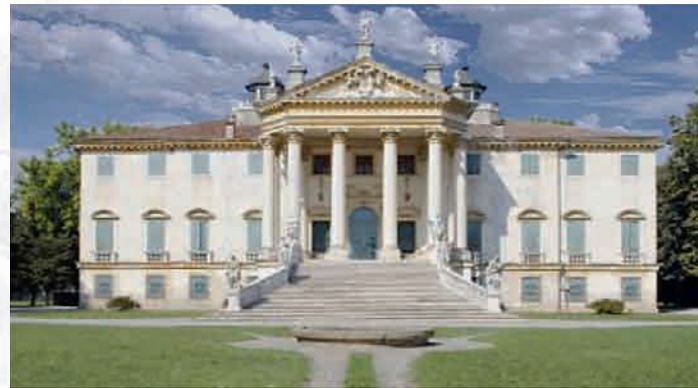
Villa Giovanelli - Noventa Padovana - Padova