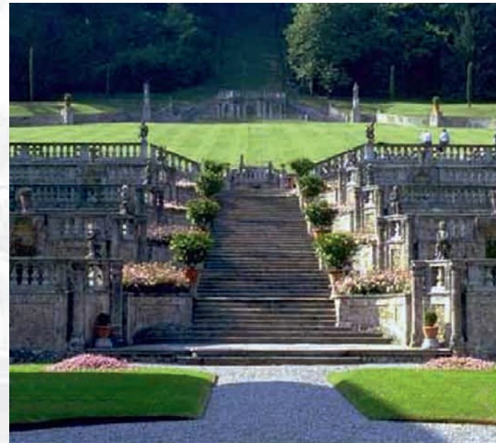
Villa Della Porta Bozzolo - Casalsuigi - Varese