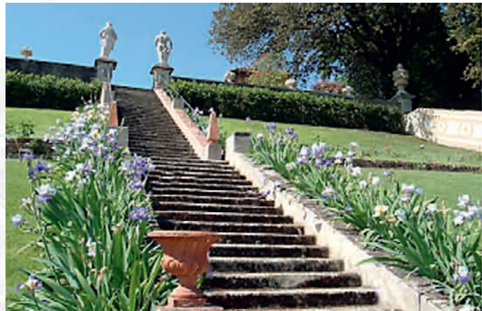
Baroque flight of steps - Bardini Garden - Florence