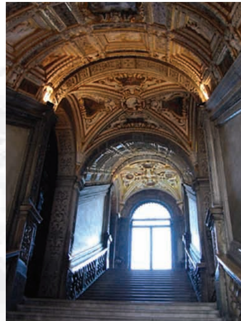
Palazzo Ducale - Venezia