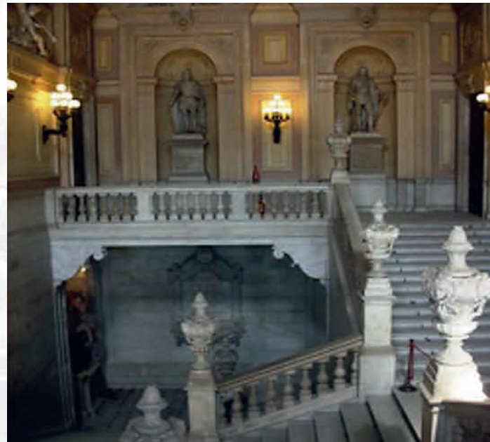
Palazzo Madama - Torino