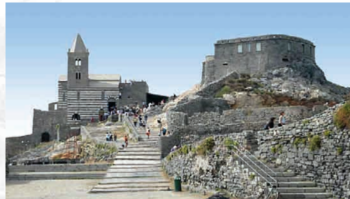
Scala Riomaggiore - La Spezia