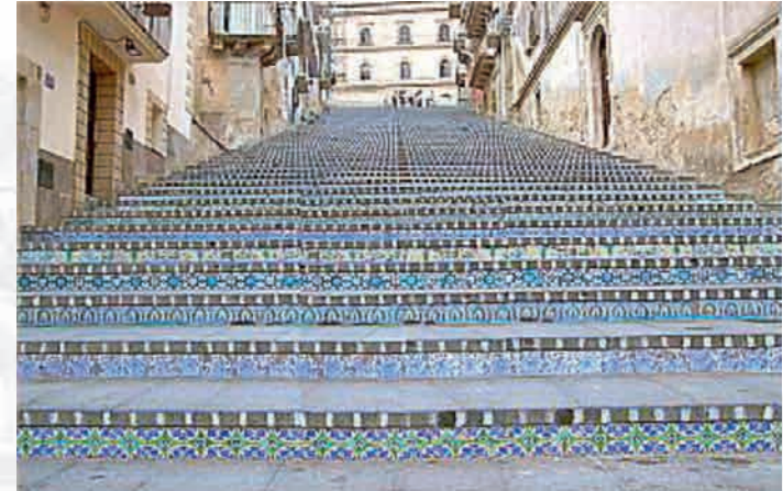
Tiled flight of steps - Caltagirone