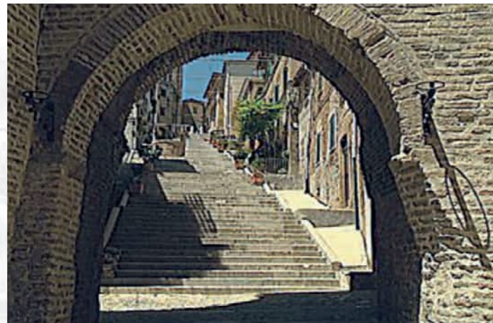
Scala la Piaggia - Corinaldo - Marche