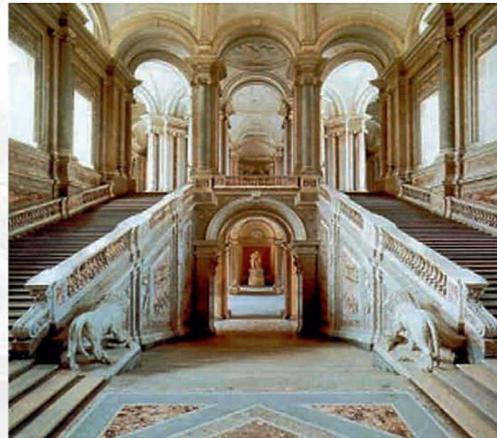
Reggia di Caserta