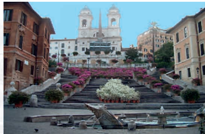
Trinità dei Monti - Roma