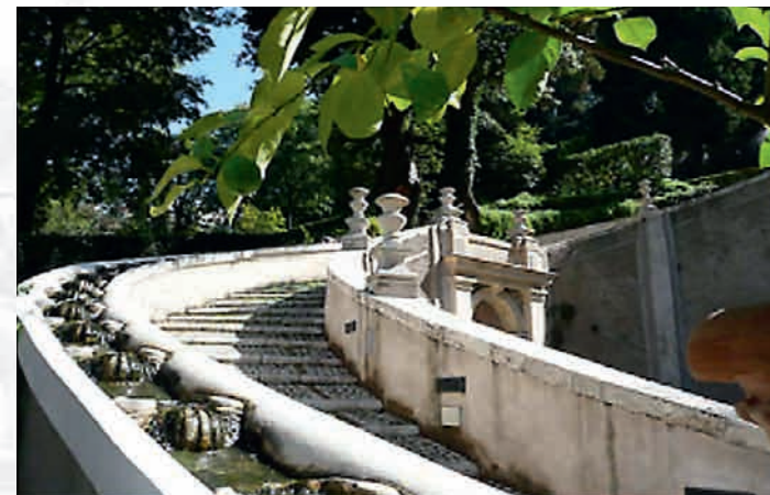
Scalinata della Fontana dei Draghi - Villa D'Este - Tivoli