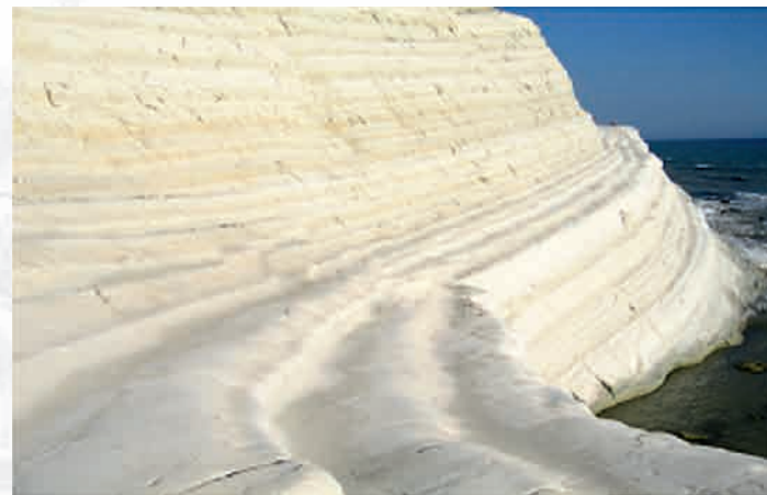
Scala dei Turchi - Agrigento